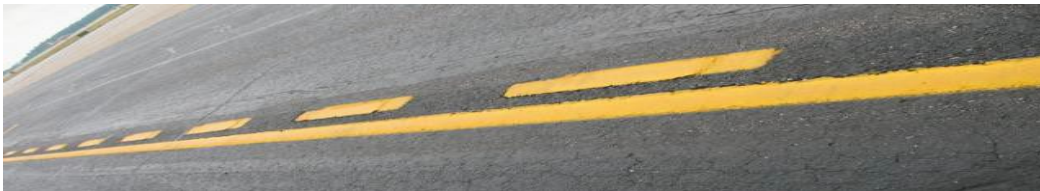
Non-Movement Area Boundary Line