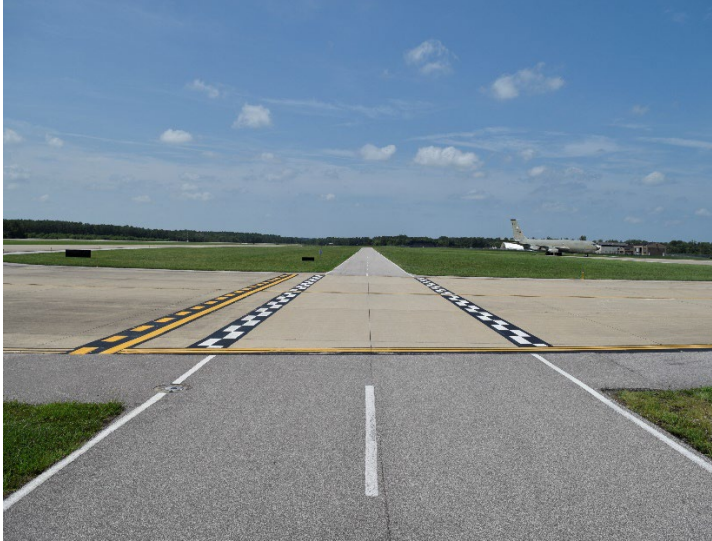
Service Road (Highlight in blue below)